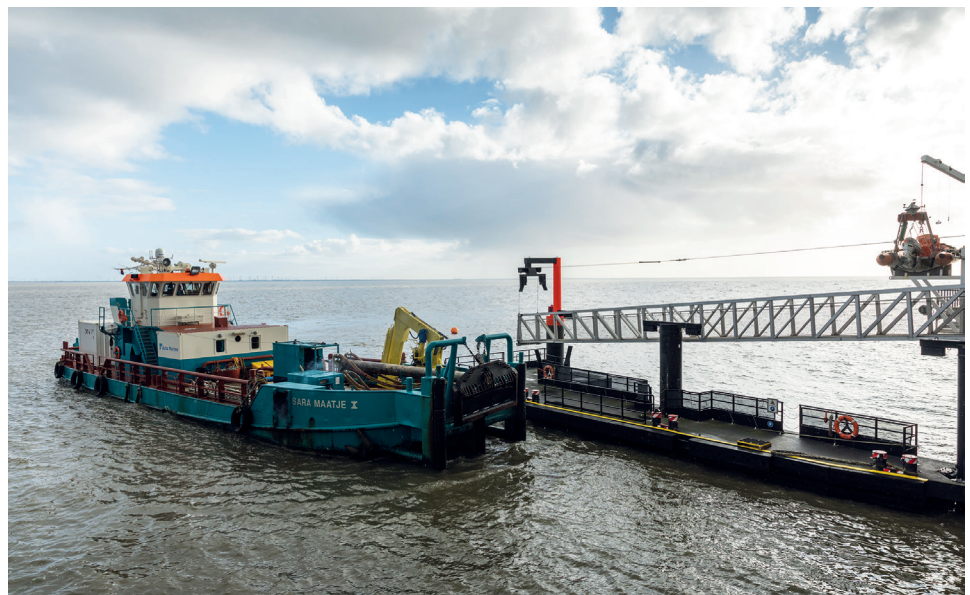
A supply vessel docking at Mittelplate.

Domestic production also offers other advantages: every cubic metre of natural gas and every tonne of crude oil produced in Germany does not have to be imported. Shorter transport routes and thus lower greenhouse gas emissions make an additional important contribution to climate protection.